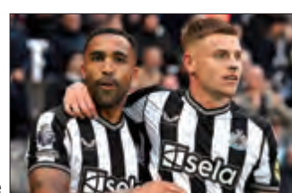
Callum Wilson (L).

Newcastle: Callum Wilson sent Newcastle into Champions League action on the back of a first Premier League win since the opening game of the season as they edged past Brentford at St James' Park. The England striker's 64th-minute penalty proved enough to clinch the points for the Magpies, who had not won since they trounced Aston Villa 5-1 on August 12 and had since slipped to back-to-back defeats by Manchester City, Liverpool and Brighton. They will now head for Italy for their Champions League opener against AC Milan on Tuesday evening in positive mood after a victory which was achieved without the rested Sandro Tonali and Alexander Isak as head coach Eddie Howe used the depth of his squad. The Bees will perhaps feel aggrieved at both the penalty decision and the fact that they gave at least as good as they got for long periods in front of a crowd of 51,670, although ultimately they were unable to trouble keeper Nick Pope often enough. (PA Media/DPA)