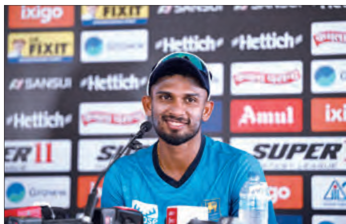
Sri Lanka's captain Dasun Shanaka attends a press conference at the R. Premadasa Stadium in Colombo on Saturday.

"Yeah, Sri Lanka are peaking at the right time. You know the boys deliberately want to deliver for the country. As a team, we've been underdogs, so everyone wants to perform on the bigger stage. These young-