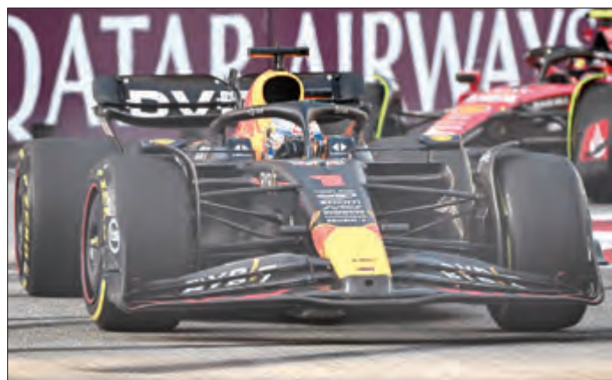
Red Bull Racing's Dutch driver Max Verstappen drives during the third practice session ahead of the Singapore Formula One Grand Prix night race at the Marina Bay Street Circuit in Singapore on Saturday.

too dramatic but it has been a tough weekend." Sainz delighted in his pole two weeks after achieving the same in Monza at the Italian GP where he then finished third, and he is taking