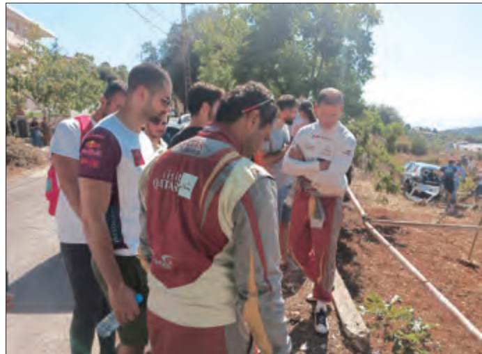
Qatar's ace rally driver Nasser Al Attiyah after being involved in an accident during the Lebanon International Rally on Saturday. Al Attiyah and French co-driver Mathieu Baumel were not seriously injured when their car rolled over and left the track, but the car was seriously damaged. Al Attiyah had won the title of the exhibition stage of the rally on Friday evening.

Al Attiyah's withdrawal came after he was involved in a very serious accident in today's stages, Saturday, which led to major damage to his car, preventing him from completing the rest of the stages, and the final day's stages on Sunday.