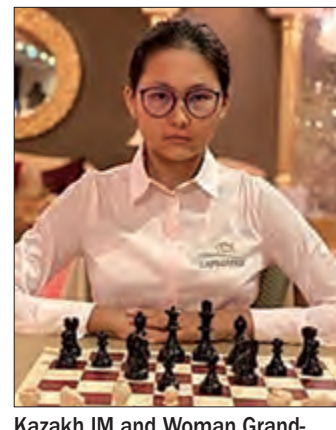
Kazakh IM and Woman Grandmaster Bibisara Assaubayeva.