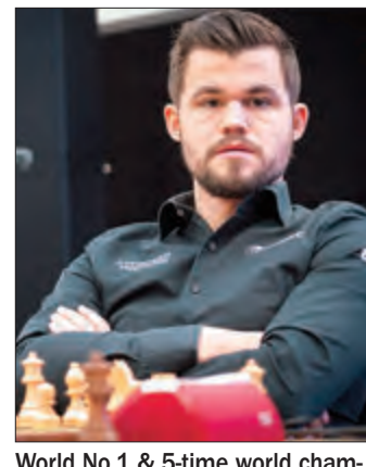
World No.1 & 5-time world champion Magnus Carlsen of Norway.