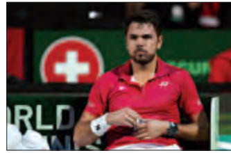
Switzerland's Stan Wawrinka reacts as he plays against France's Ugo Humbert during their men's singles of the Davis Cup finals for Group B at the AO Arena, in Manchester on September 12, 2023.

over Switzerland on Friday, Wawrinka said: "We see the difference between today and three days ago - it's not normal. I played some Challenger tournaments this year and there were way more people and a way better atmosphere than when we played France.