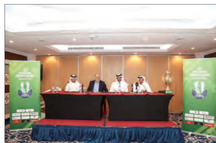
Officials address the media at Al Gharafa Complex on Saturday, the eve of the FIBA U16 Asian Championship 2023.

Stroll walked away unharmed but the car was badly damaged and the barrier repair led to a lengthy delay.