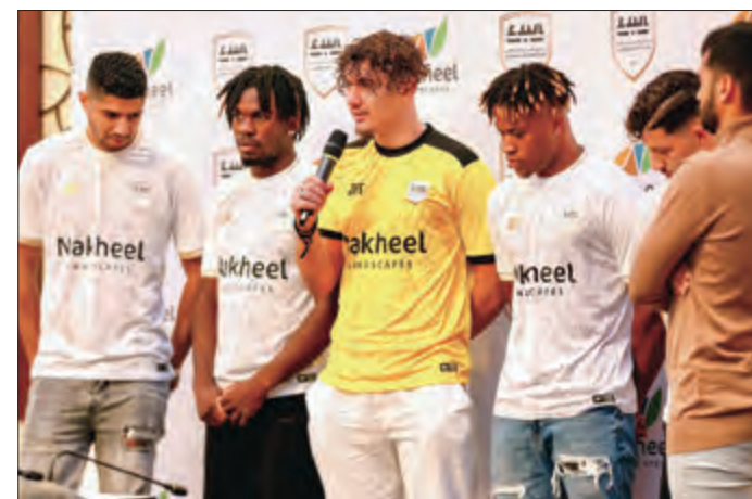
Al Bidda SC's new professional players speak to the media during the press conference on Saturday.