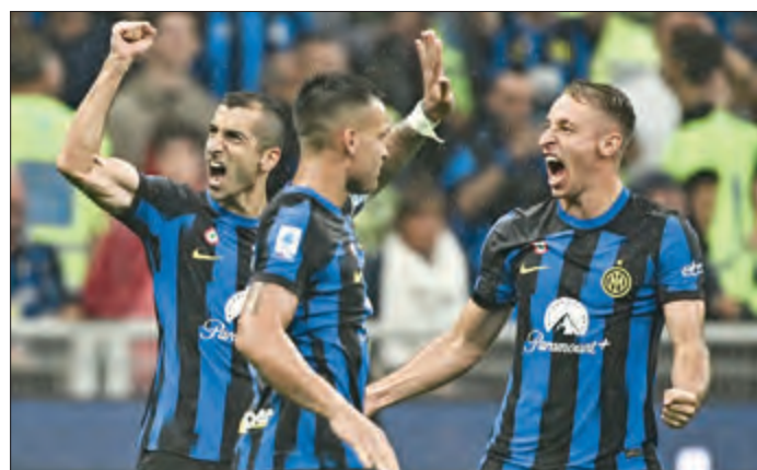
Inter Milan's Armenian midfielder #22 Henrikh Mkhitaryan (L), Inter Milan's Argentine forward #10 Lautaro Martinez (C) and Inter Milan's Italian midfielder #16 Davide Frattesi (R) celebrate after a goal during the Italian Serie A match against AC Milan at the San Siro Stadium in Milan on Saturday.

Fourth-placed Stuttgart's strong start continued with a 3-1 success at Mainz thanks to league top scorer Serhou Guirassy's hat-trick.