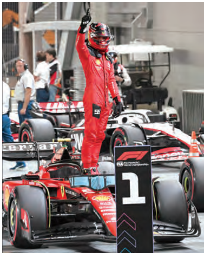
Ferrari's Spanish driver Carlos Sainz Jr gestures after the qualifying session of the Singapore Formula One Grand Prix night race at the Marina Bay Street Circuit in Singapore on Saturday.