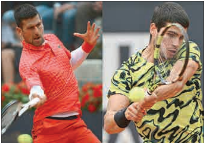
File photographs of Serbia's Novak Djokovic (L) and Spain's Carlos Alcaraz.