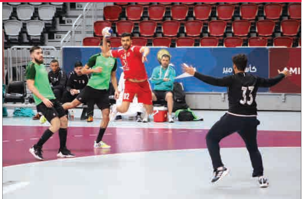
Al Rayyan made it to the final of HH Amir Cup Handball prevailing over Al Wakrah 28-25 in the semi-finals played at the Duhail Handball Sports Hall on Thursday. Al Arabi qualified for the final defeating Al Ahli in a close contest 34-33. The final will be played on Saturday, May 27.