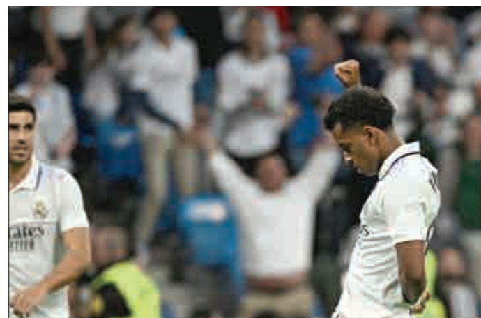
Real Madrid's Brazilian forward Rodrygo celebrates scoring his team's second goal during the Spanish league football match against Rayo Vallecano de Madrid in Madrid on Wednesday.

Dani Carvajal volleyed wide from Luka Modric's chip as Madrid looked to put