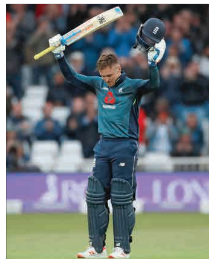
A file pic of England's Jason Roy celebrating his century against Pakistan at Trent Bridge, Nottingham.

His decision is the latest in a fast-changing landscape of global cricket, with the money on offer to players in franchise leagues challenging the primacy of international matches.