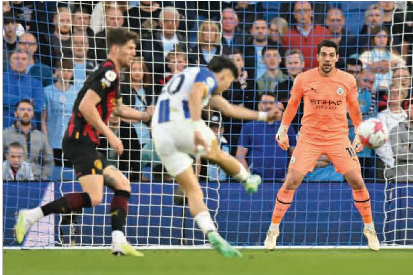
Brighton's Paraguayan striker Julio Enciso (C) shoots and scores his team first goal during the English Premier League match against Manchester City at the American Express Community Stadium in Brighton on Wednesday.