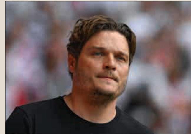
Dortmund's headcoach Edin Terzic in Augsburg recently.

Asked if he wanted to help his mentor by beating Tuchel's ex-side Dortmund, Svensson shrugged: "It doesn't matter. It's about helping ourselves."