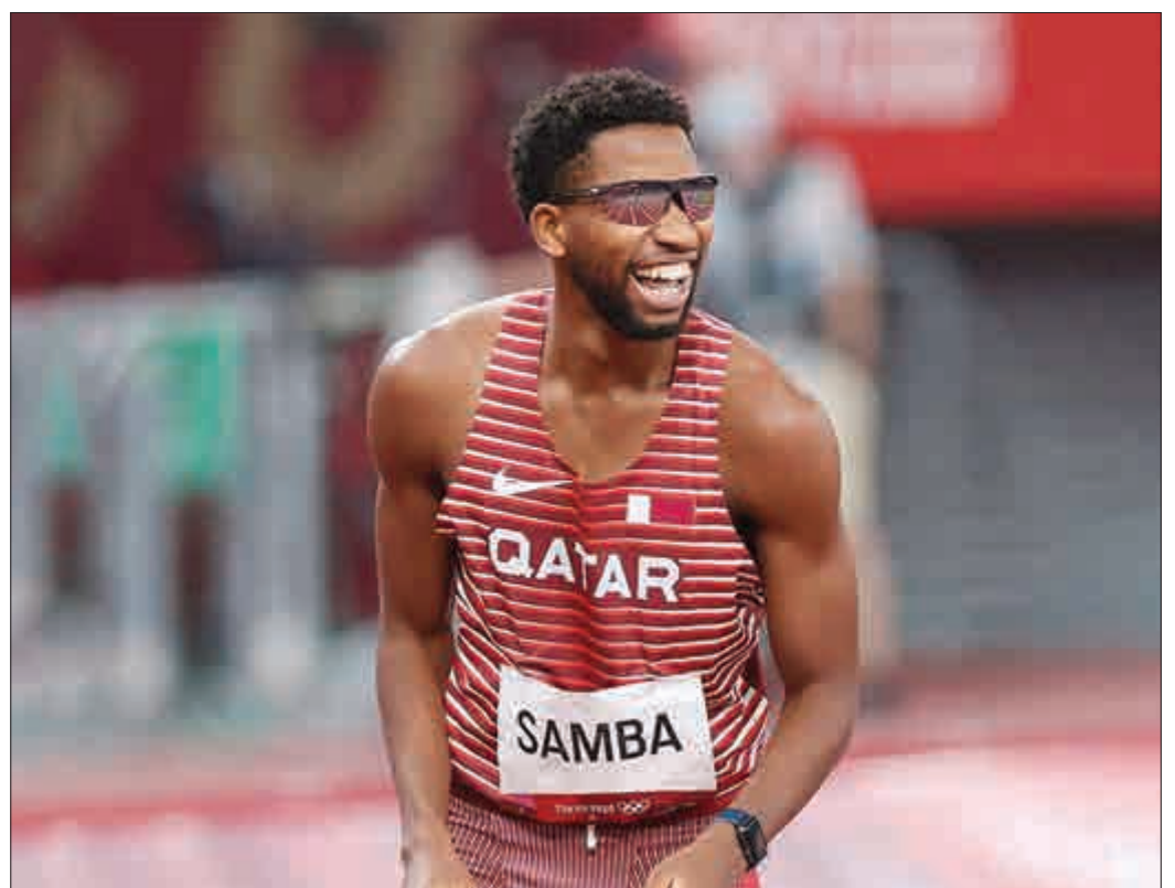
Qatar's 400m hurdles star Abdurrahman Samba has returned to action after an absence of two years due to injury.

In the 400m hurdles, an event that is increasingly making headlines thanks to Norway's world record holder