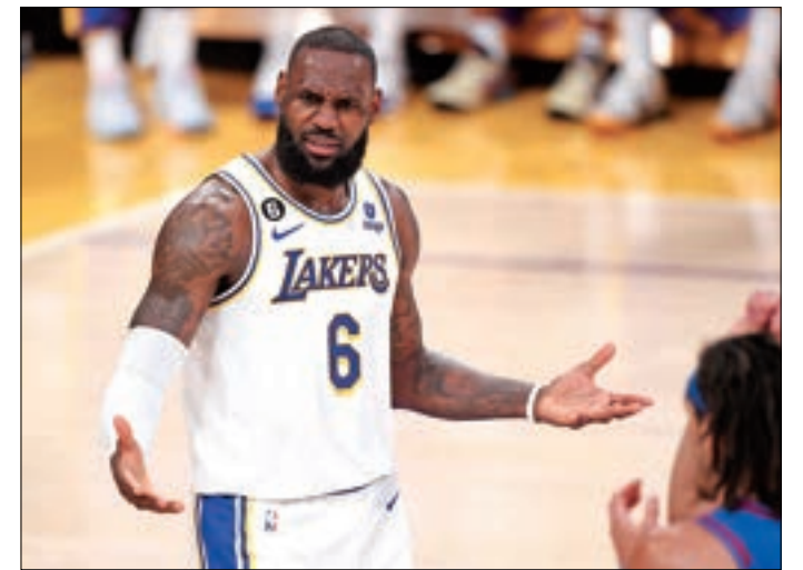
File photo of LeBron James

He has previously revealed a desire to play alongside his son Bronny, 18, who currently plays college basketball for the University of Southern California and will be eligible for the NBA next year.