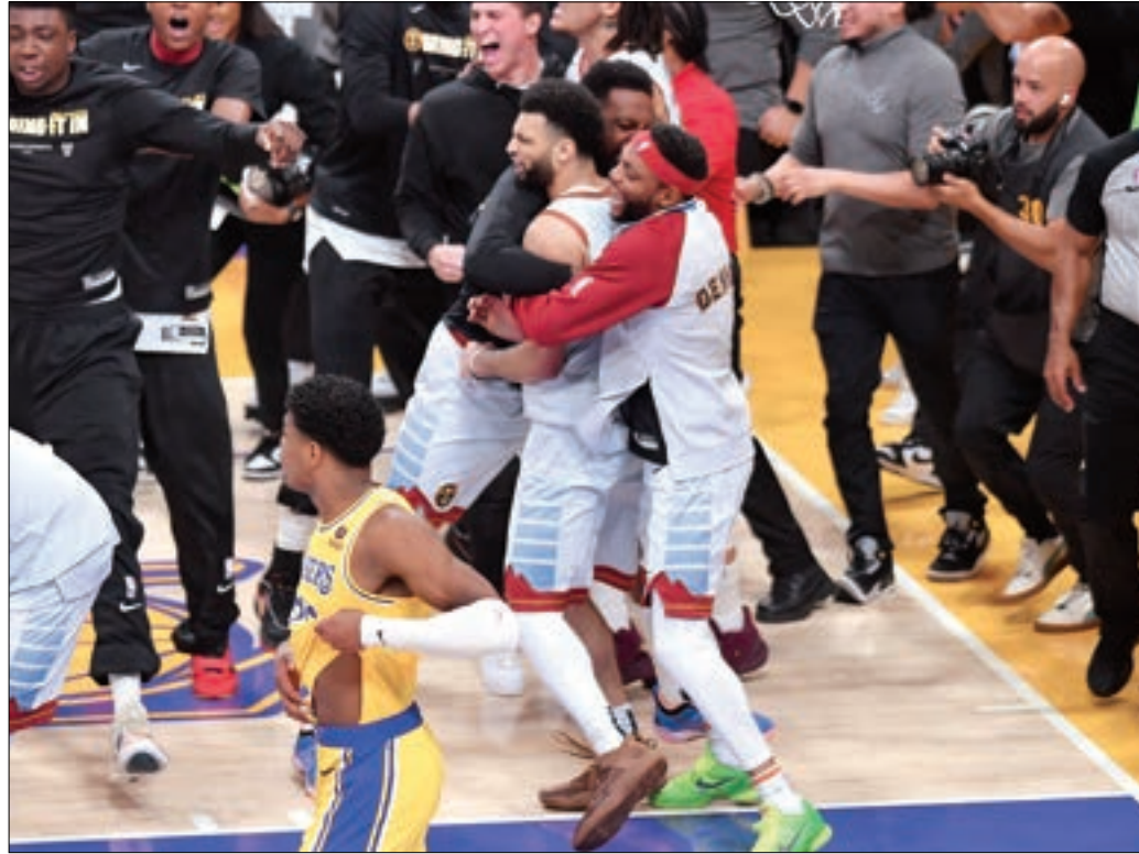
Jamal Murray #27 of the Denver Nuggets celebrates after the series clinching victory against the Los Angeles Lakers in game four of the Western Conference Finals in Los Angeles, California on Monday.

The Lakers had built a seemingly comfortable 73-58 half-time lead behind 31 points from LeBron James, his highest scoring total in a half in a play-off game in his illustrious career.