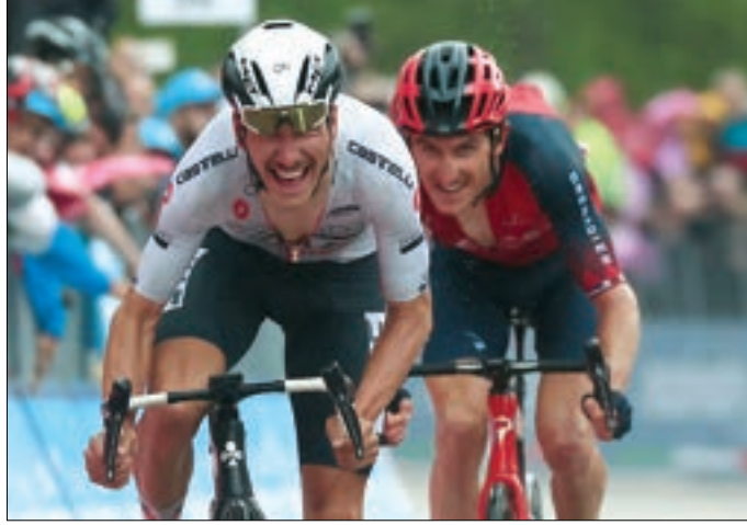
UAE Team Emirates's Portuguese rider Joao Almeida (L) sprints to win ahead of INEOS Grenadiers's British rider Geraint Thomas during the 16th stage of the Giro cycling race near Cavedine, on Tuesday.

Almeida, though, who had the most left in the tank to sprint clear in the final 150 metres to claim victory for UAE Team Emirates and pick up maximum bonus seconds.