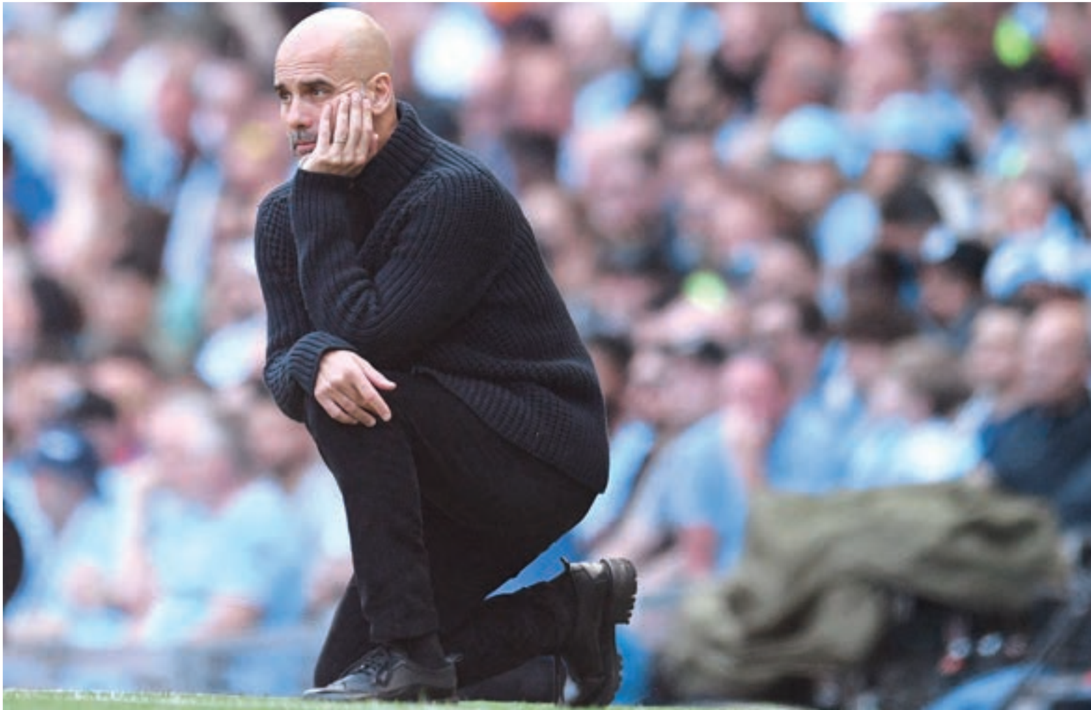
Manchester City's Spanish manager Pep Guardiola watches the players from the touchline during the English Premier League match against Chelsea at the Etihad Stadium in Manchester recently.