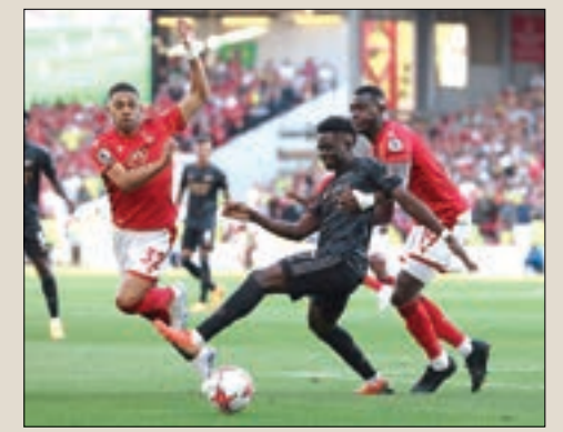
Bukayo Saka (centre).

"There is no team playing the way they play, it's unique. I have the feeling when he arrived the impact he would have in the Premier League would be great - I didn't expect them to do it in this short space of time."