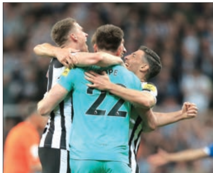
Newcastle United's teammates celebrate at the end of the English Premier League match against Newcastle Leicester at St James' Park in Newcastle-upon-Tyne on Monday.

might unsettle his team proved unfounded as they took the game by the scruff of the neck amid a party atmosphere at St James' Park, although Gui-