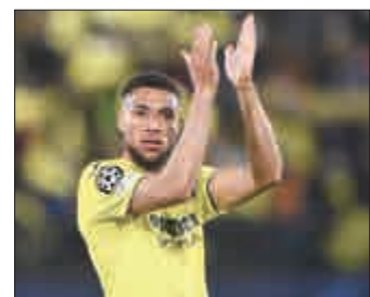
Dutch midfielder Arnaut Danjuma Groeneveld.

Stats Perform understands Everton, who sacked Frank Lampard on Monday, had been expecting Danjuma to arrive at their Finch Farm training base to complete the formalities of his move on Tuesday. He had already undergone a medical with the struggling club.