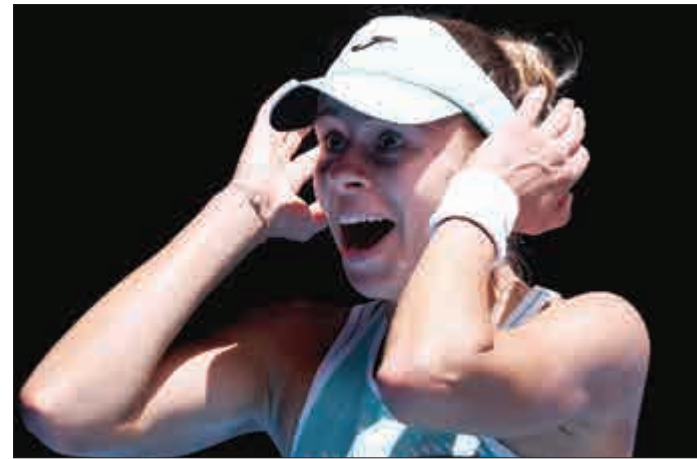
Poland's Magda Linette celebrates victory against Czech Republic's Karolina Pliskova during their women's singles quarter-final match on day ten of the Australian Open on Wednesday.

The match was closer than the scoreline suggested but Croatian Vekic, playing in only