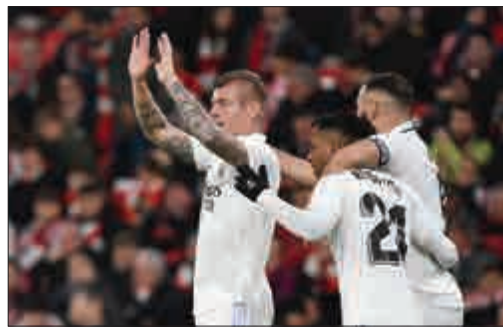
Real Madrid's Toni Kroos (left) celebrates with teammates after scoring a goal during the Spanish League match in Bilbao on Sunday.

Speaking ahead of Thursday's Copa del Rey quarter-final against rivals Atletico Madrid, An-