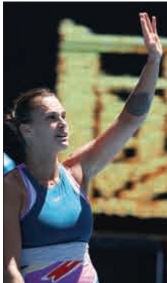
Belarus' Aryna Sabalenka celebrates after her victory against Croatia's Donna Vekic at the Australian Open on Wednesday.