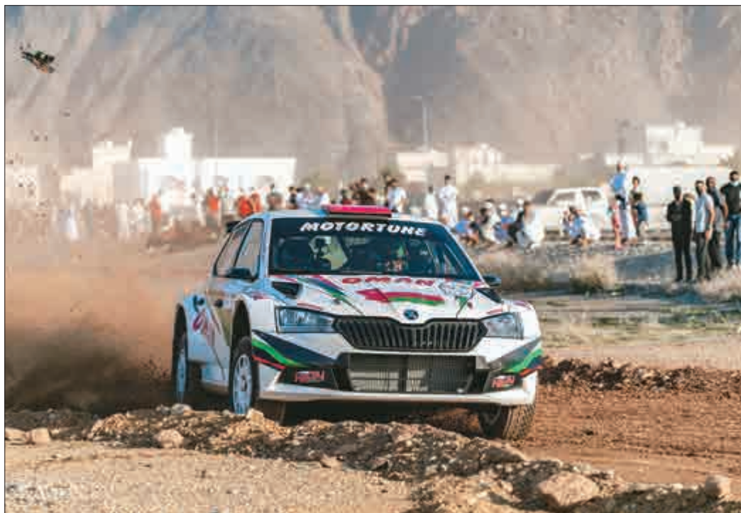
A short super special stage will get the action underway in Oman on Thursday afternoon.