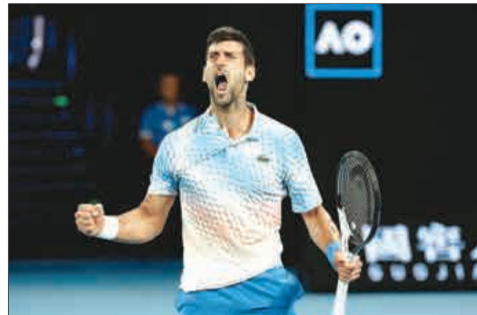
Serbia's Novak Djokovic reacts on a point against Russia's Andrey Rublev during their men's singles quarter-final match of the Australian Open in Melbourne on Wednesday.

"I knew what the game plan was, but it's one thing to imagine how you want to play and another to execute it on the