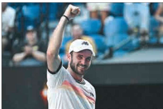
Tommy Paul of the US celebrates after beating compatriot Ben Shelton in their Australian Open men's singles quarter-final on Wednesday.