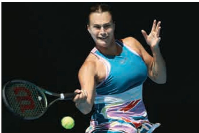
Belarus' Aryna Sabalenka hits a return against Switzerland's Belinda Bencic during their women's singles match on day eight of the Australian Open in Melbourne on Monday.

Actually, even when my serve was working, it wasn't really right. "I was, in that moment, open for whatever. I was