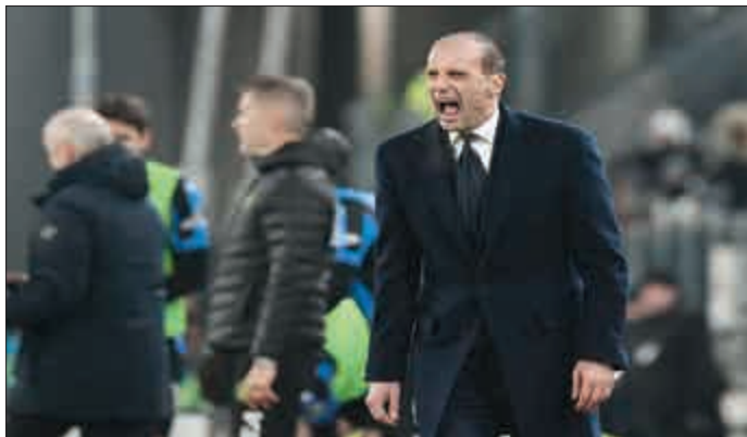
Juventus' coach Massimiliano Allegri during the Italian Serie A match against Atalanta at the Juventus Stadium in Turin on Sunday.

Allegri vowed to stay at Juve after the punishment and reiterated his commitment as he suggested he made the right choice