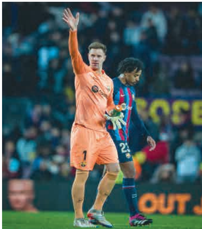
Barcelona goalkeeper Ter Stegen.

The hosts were without Robert Lewandowski due to the striker's suspension, and it showed, with Ansu Fati not