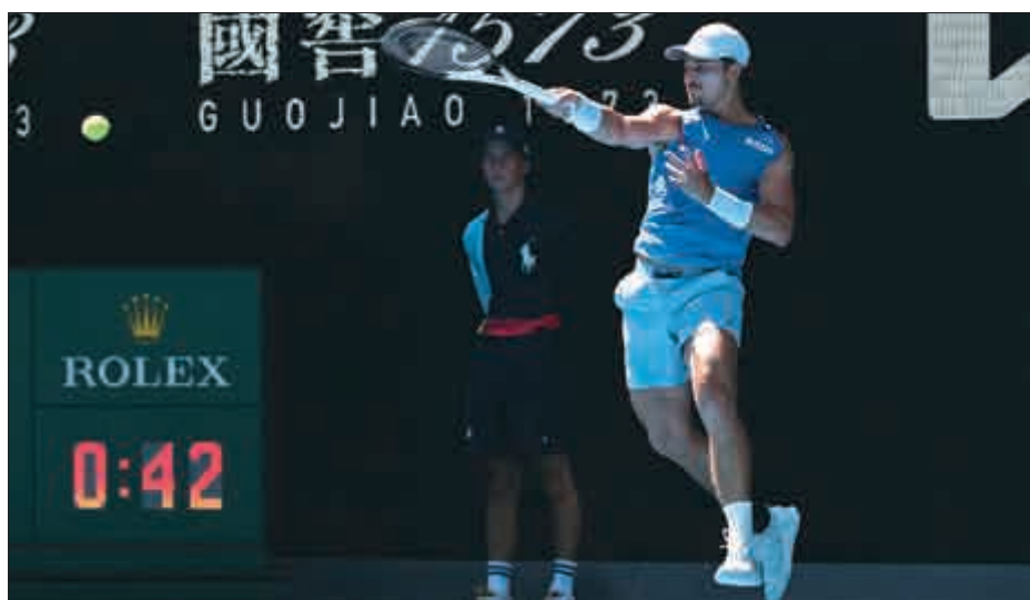
USA's JJ. Wolf hits a return against USA's Ben Shelton during their match on Monday.

While Korda will face Karen Khachanov for a place in the semi-finals, Paul will go head-to-head with Shelton, the world number 89.