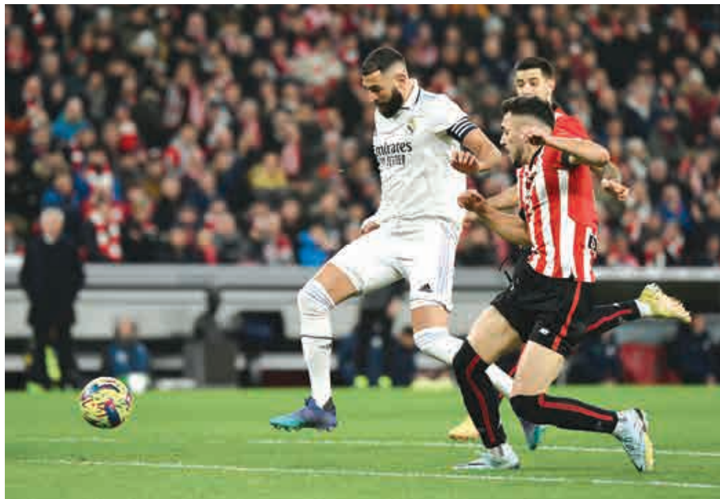
Real Madrid's French forward Karim Benzema (left) vies for the ball with Athletic Bilbao's defender Aitor Paredes during the Spanish League match at the San Mames stadium in Bilbao on Sunday.

"It's true that we had opportunities to close the game and we didn't.