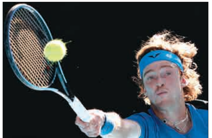
Russia's Andrey Rublev hits a return against Denmark's Holger Rune during their men's singles match at the Australian Open on Monday.

Shelton, who is still in college, said: "It's definitely a surprise.