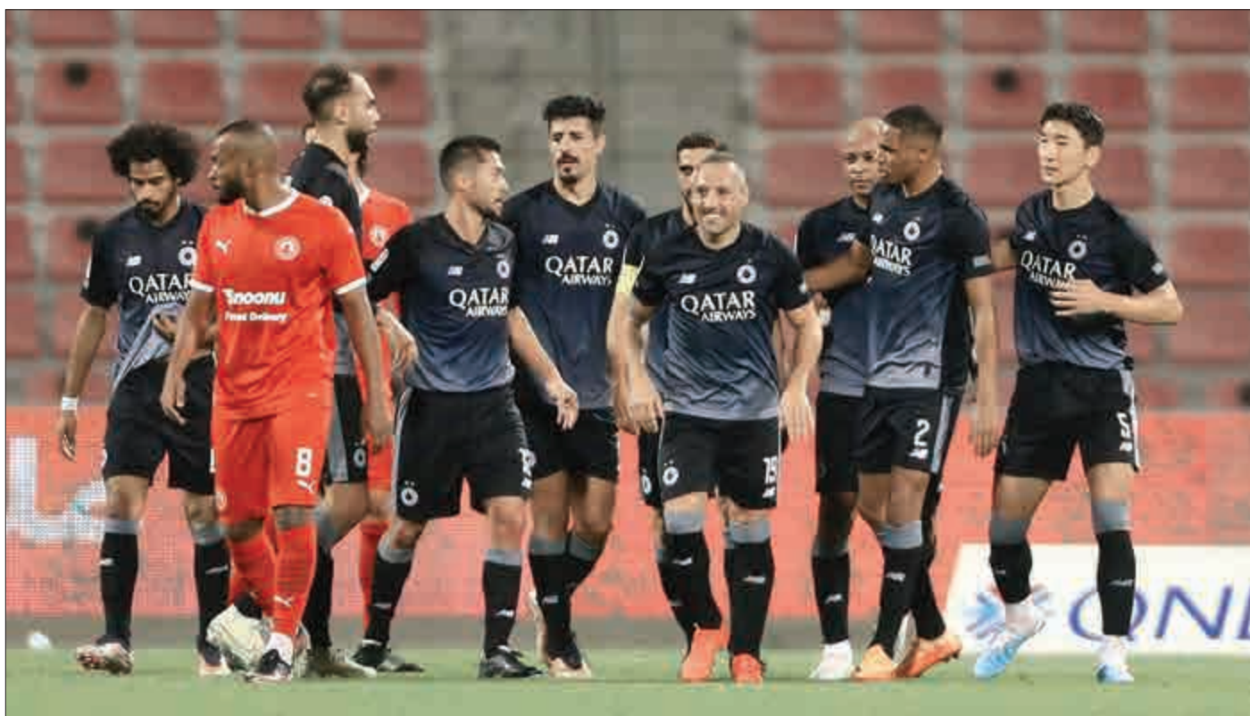
Al Sadd players celebrate their opening goal against Al Arabi in their QNB Stars League Week 11 match, played at the Grand Hamad Stadium on Monday.

The big moment came when a Bounedjah kick hit the hand of Aron Gunnarsson just on the left-side edge of the