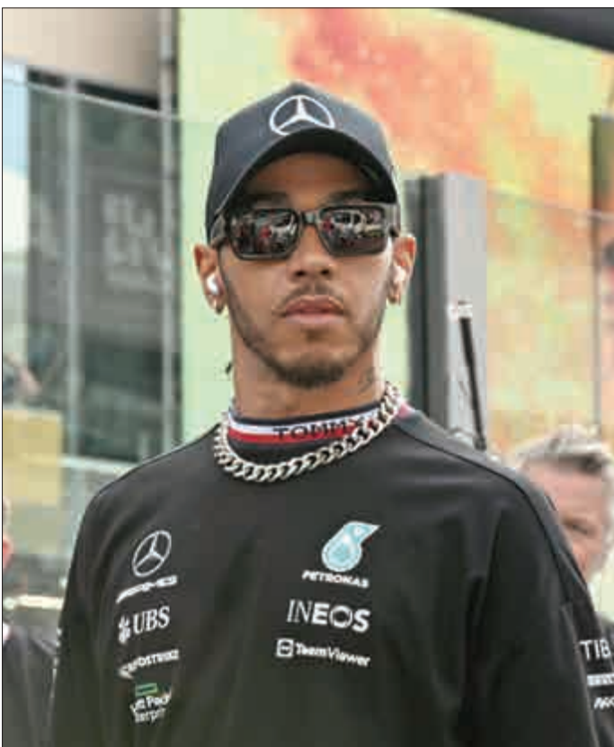
Seven-time Formula One champion Lewis Hamilton.

Hamilton remains F1's sole black driver. He has established Mission 44 - which aims to enhance the lives of people from under-represented groups - and Ignite, a joint enterprise with his Mercedes team to improve diversity and inclusion in motor racing.