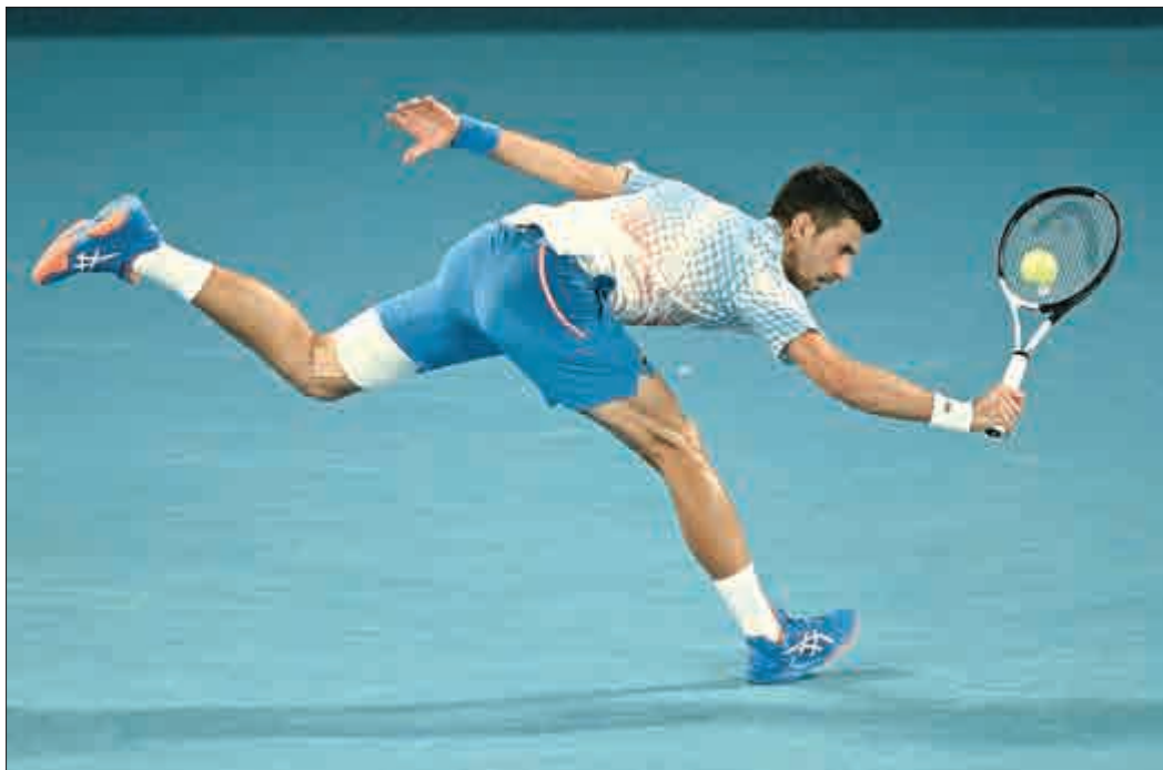
TOPSHOT - Serbia's Novak Djokovic hits a return against Australia's Alex De Minaur during their men's singles match on day eight of the Australian Open on Monday. (AFP)

The Dane arrived at Melbourne Park as the hottest