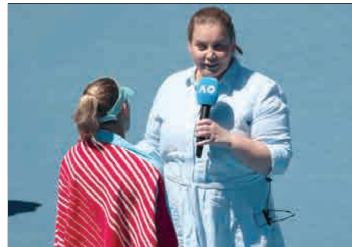
Player-turned commentator Jelena Dokic (R) talks to Poland's Magda Linette after her women's singles match against France's Caroline Garcia at the Australian Open in Melbourne on Monday.

In 2000, she represented Australia at the Sydney Olympics, and also reached the Wimbledon semi-finals. Her world ranking peaked at No.4 after reaching the 2002 French