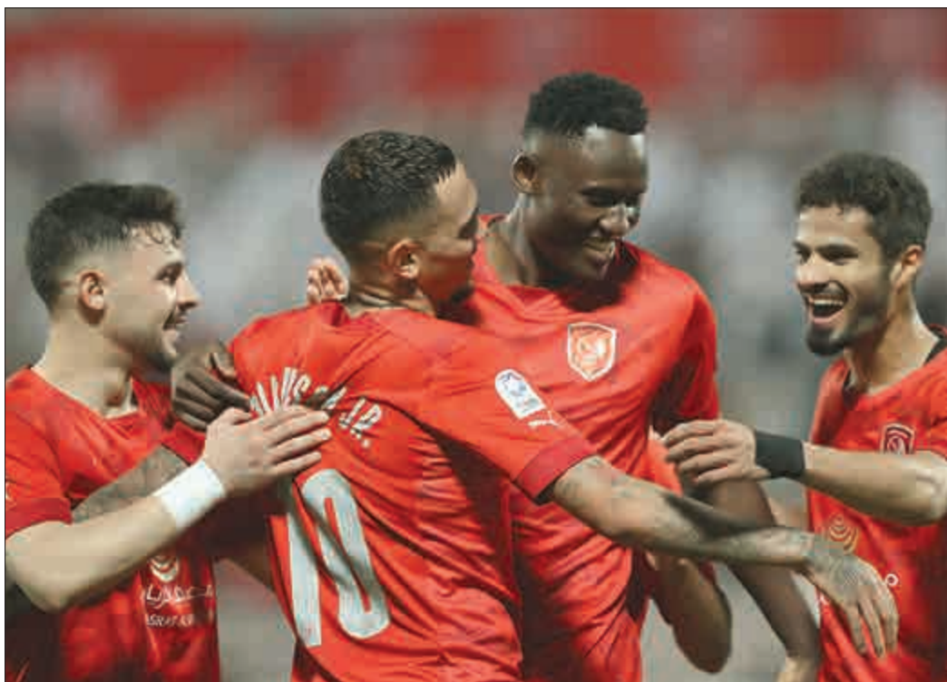
Al Duhail players rejoice with Michael Olunga (2nd right) after he scored one of his two goals against Umm Salal in their QNB Stars League Week 11 match at the Abdullah Bin Khalifa Stadium on Monday.

to hand Umm Salal a 2-0 defeat at the Abdullah Bin Khalifa Stadium.