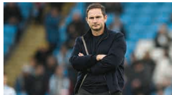
Everton's English manager Frank Lampard watches his players warm up ahead of an English Premier League match at the Etihad Stadium in Manchester recently.