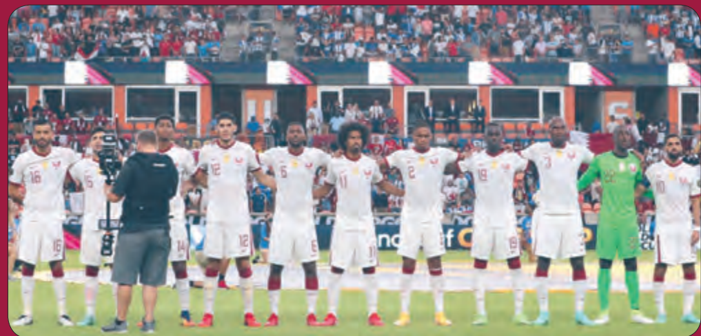
The Qatar national team during the recently held CONCACAF Gold Cup in the US.