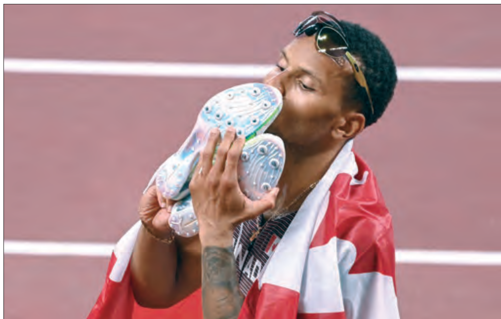
Canada's Andre De Grasse, wrapped in the Canadian national flag, kisses his running shoes as he celebrates winning the men's 200m final at the Tokyo 2020 Olympic Games in Tokyo on Wednesday.

Vallauri estimated their 12th Olympic track, which includes three-dimensional