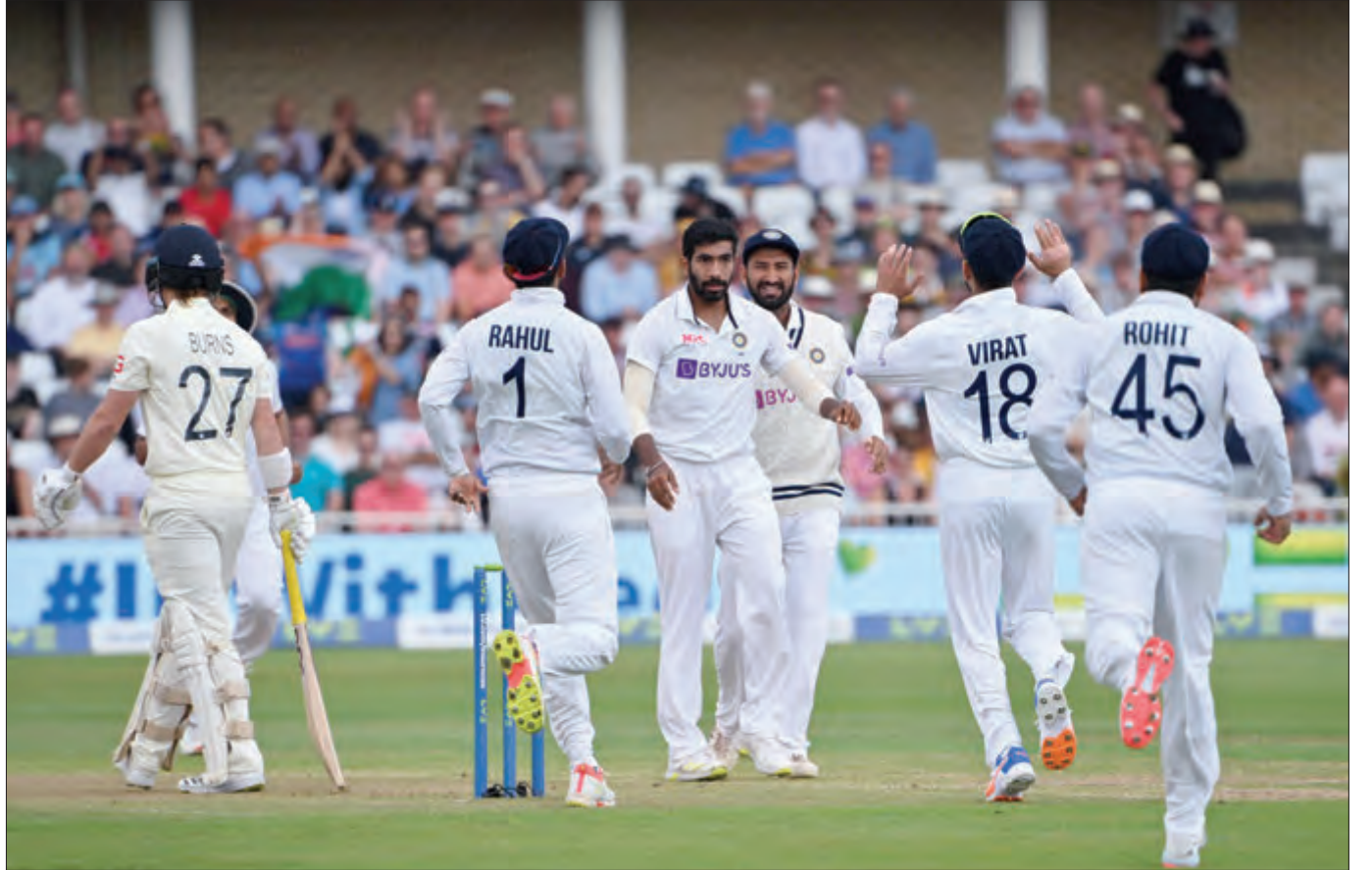
India's Jasprit Bumrah (C) celebrates with teammates after taking the wicket of England's Rory Burns (L) for a duck on the first day of the first Test against India at the Trent Bridge cricket ground in Nottingham, Nottinghamshire, on Wednesday.

Shami, who had removed Bairstow at the stroke of Tea, struck four balls after the break by having Daniel Lawrence caught down the leg side, a soft dismissal.