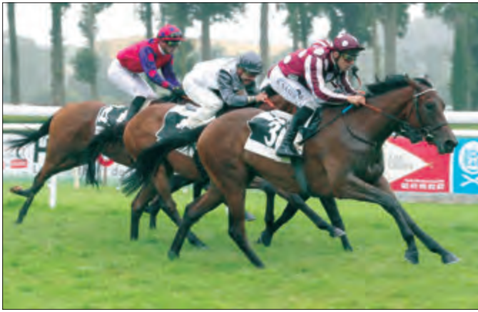
Jomaanah the Prix Chateaufort sur Sarthe at Le Lion d'Angers in France on Wednesday.