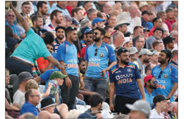
India supporters look on from the crowd during play on the first day of the first Test between England and India at Trent Bridge in Nottingham on Wednesday.

Scores: Australia 121/7 (Mitchell Marsh 45, Moises Henriques 30, Mustafizur Rahman 3-23); Bangladesh 123/5 (Afif Hossain 37*, Nurul Hasan 22*, Ashton Agar 1-17).