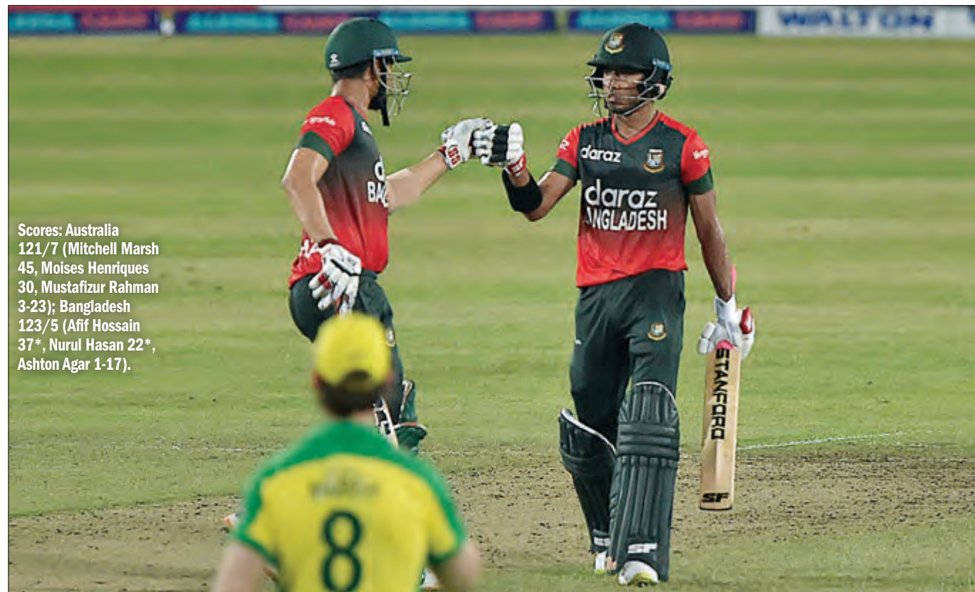
Bangladesh's Afif Hossain (R) celebrates with teammate Bangladesh's Nurul Hasan after winning the second Twenty20I against Australia at the Sher-e-Bangla National Cricket Stadium in Dhaka on Wednesday.

Scores: Australia 121/7 (Mitchell Marsh 45, Moises Henriques 30, Mustafizur Rahman 3-23); Bangladesh 123/5 (Afif Hossain 37*, Nurul Hasan 22*, Ashton Agar 1-17).