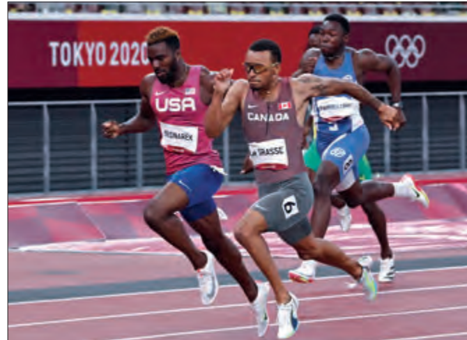
First-placed Canada's Andre De Grasse crosses the finish line to win followed by second-placed USA's Kenneth Bednarek (rear C) in the men's 200m final of the Tokyo 2020 Olympic Games at the Olympic Stadium in Tokyo on Wednesday.

Chemutai caught up and ran away from courageous American leader Courtney Frerichs in the final 200m for gold in 9 minutes 1:45 sec-