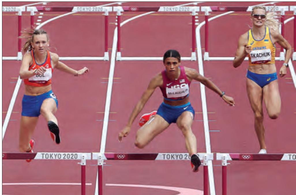
USA's Sydney McLaughlin (C) wins the women's 400m hurdles final setting a new world record during the Tokyo 2020 Olympic Games at the Olympic Stadium in Tokyo on Wednesday.

There were also fast times in the men's 200m where Canada's Andre de Grasse got a first major title at last as successor to Usain Bolt in the 200m - with whom he fa-