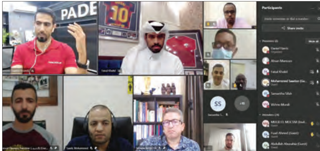
Online parties included football fun, interactive games and special guests.

Fans were introduced to former Mexico striker Luis Hernández, the joint highest World Cup goal scorer for his country, who discussed the Mexicans' tactics and preparations for 2022. Additionally,