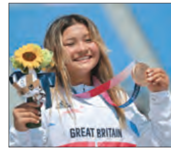
Bronze medallist Britain's Sky Brown poses on the podium of the women's park final at Ariake Sports Park Skateboarding in Tokyo on Wednesday.