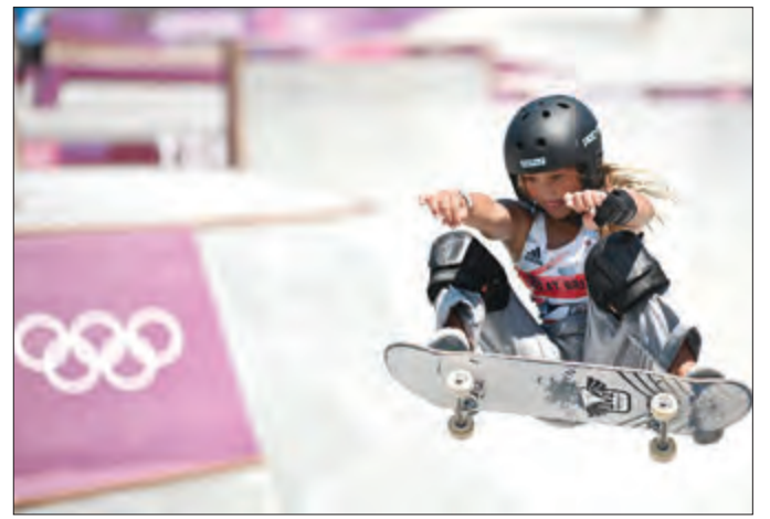
Britain's Sky Brown competes in the women's park final during the Tokyo 2020 Olympic Games at Ariake Sports Park Skateboarding in Tokyo on Wednesday.