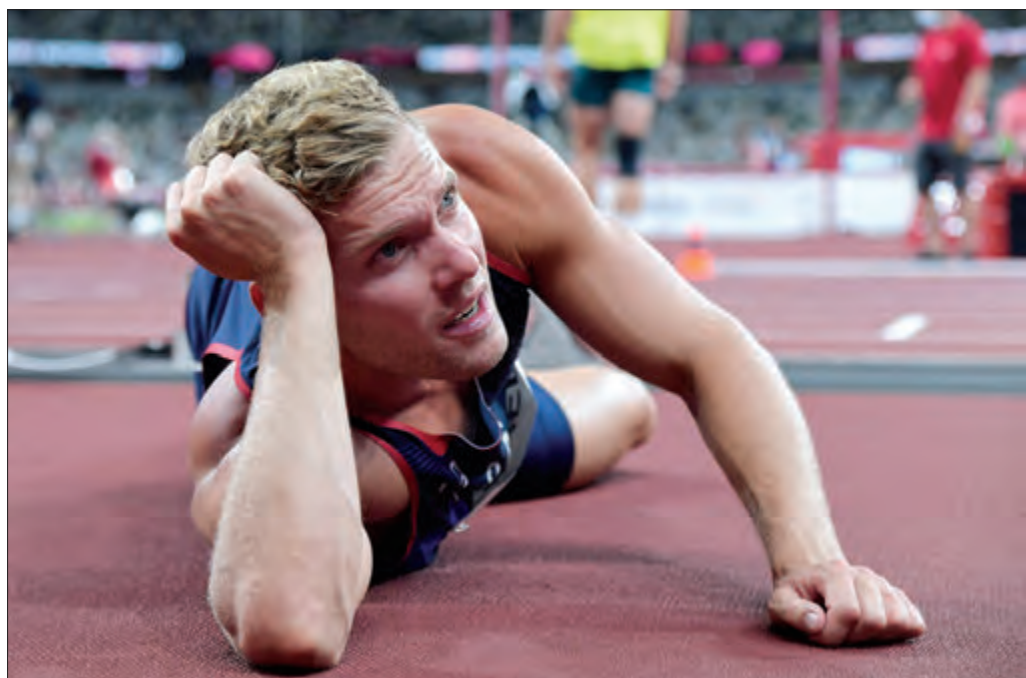
France's Kevin Mayer lies on the track ahead of his attempt in the men's decathlon high jump during the Tokyo 2020 Olympic Games at the Olympic Stadium in Tokyo on Wednesday.

granules in the surface, leads to a performance gain of around 2 per cent - a lot in events where hundredths of a second decide.