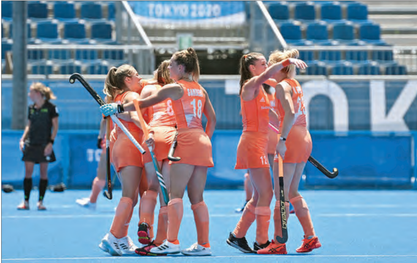
Players of Netherlands celebrate after defeating Britain 5-1 in their women's semi-final match of the Tokyo 2020 Olympic Games field hockey competition, at the Oi Hockey Stadium in Tokyo on Wednesday.

Whether they can bounce back in 48 hours from such a