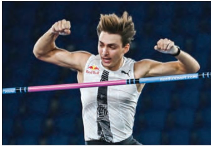
Sweden's Armand Duplantis cleared 6.15m to eclipse Ukrainian legend Sergey Bubka's 26-year mark in men's pole vault during the IAAF Diamond League competition on at the Olympic stadium in Rome on September 17.

Duplantis is joined in Doha by reigning world champion Sam Kendricks (USA), in addition to London 2012 Olympic gold medallist Renaud Lavillenie (France).