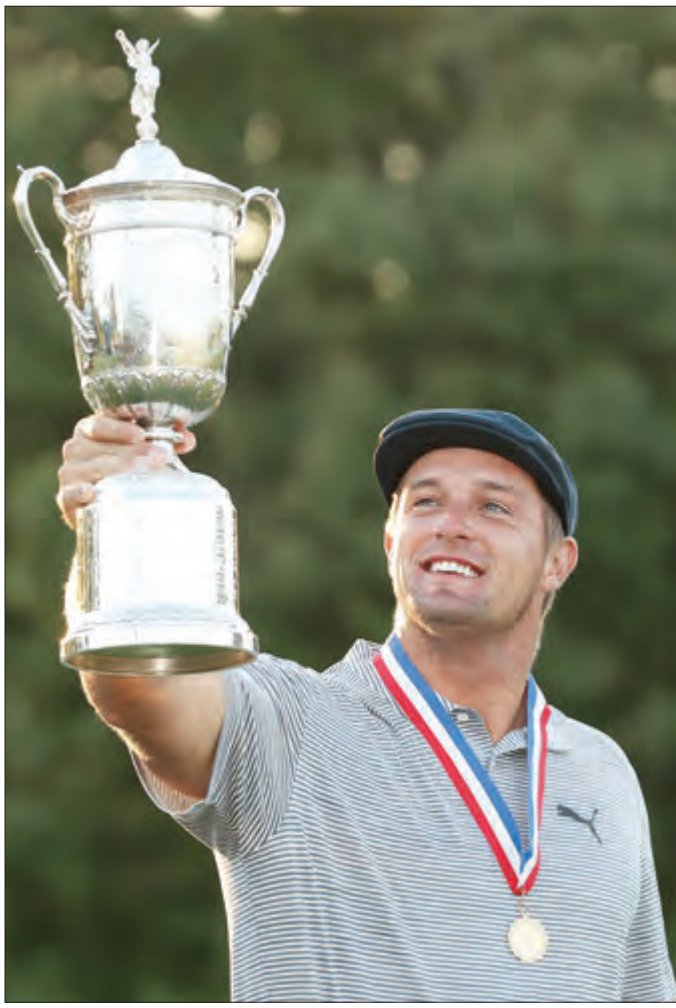
Bryson DeChambeau of the United States celebrates with the trophy after winning the 120th U.S. Open Championship at Winged Foot Golf Club in Mamaroneck, New York, on Sunday.

Wolff led last-duo partner DeChambeau by two strokes