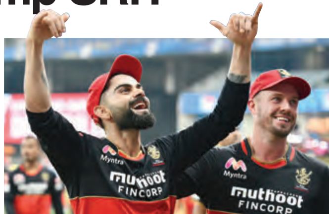
Royal Challengers Bangalore skipper Virat Kohli with AB de Villiers celebrates his team's opening IPL 2020 win over Sunrisers Hyderabad in Dubai on Monday.

The David Warner-led Hyderabad collapsed from a