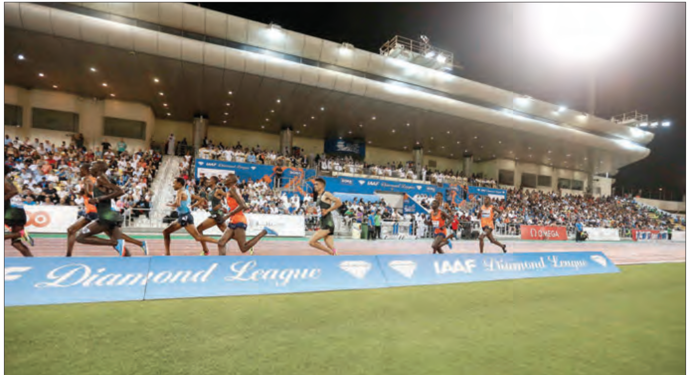
Doha's Qatar Sports Club will host the revised 12-event programme for the Wanda Doha Diamond League which includes sprint hurdles and 800m for both men and women; 100m, 3000m and long jump for women; and 200m, 400m, 1500m and pole vault for men.

In the women's 3000m, an exciting field brings together Kenyan quartet Hellen Obiri and Beatrice Chepkoech, 2019 world champions over 5000m and 3000mSC respectively, in addition to Olympic 3000mSC silver medallist Hyvin Kiyeng; world 5000m runner-up Margaret Chelimo Kipkemboi; world 1500m bronze medallist Gudaf Tsegay (Ethiopia); and world 10,000m