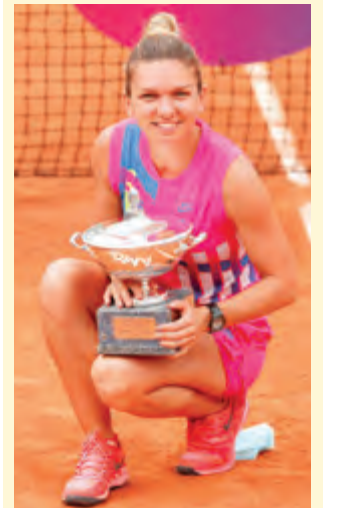
Romania's Simona Halep poses with her trophy after winning the Women's Italian Open at Foro Italico in Rome, Italy, on Monday.

"You have to be really careful where you go, and still you don't know if you can get it or where you can get it and from who. I mean, that's the situation right now."