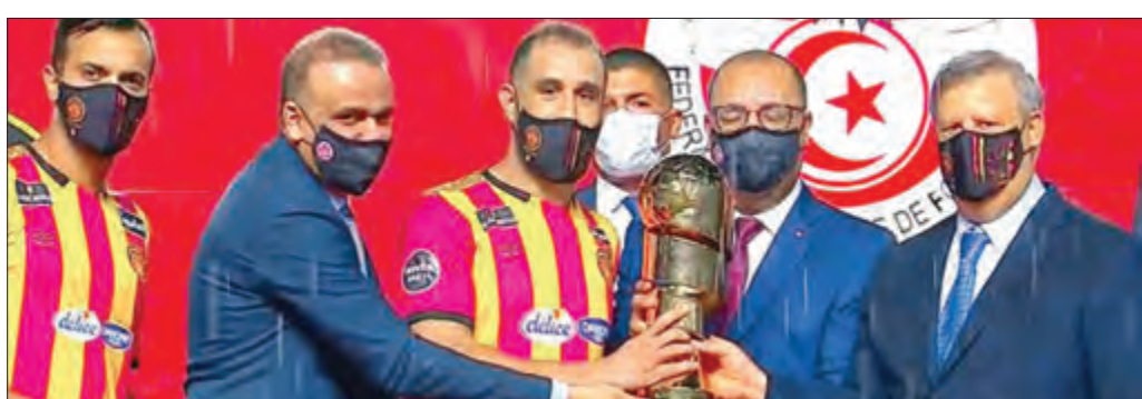
Esperance Sports Tunisia won their fifth Tunisian Super Cup title beating rivals CS Sfaxien 5-4 on penalties after a goalless draw at Rades, Tunisia.

The two teams reserved a seat in the next edition of the African Champions League.