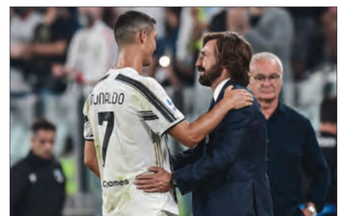
Juventus' Italian coach Andrea Pirlo (right) congratulates Portuguese forward Cristiano Ronaldo as Sampdoria's Italian coach Claudio Ranieri looks on at the end of their Italian Serie A match at the Juventus Stadium in Turin on Sunday.

The result leaves the Isfahan based side in third with four points, one ahead of Al Ain who trail the group.