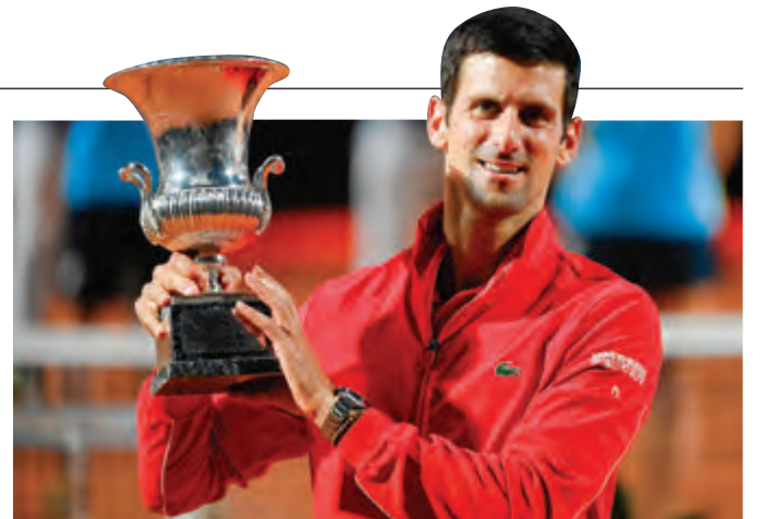
Serbia's Novak Djokovic poses with his trophy after winning the Men's Italian Open final at Foro Italico in Rome, Italy, on Monday.

"Over the course of these four years, every year I've gotten a little bit better. I've gotten in the top 10 now. I don't know how much better I can get, but I'm going to keep trying every single week."