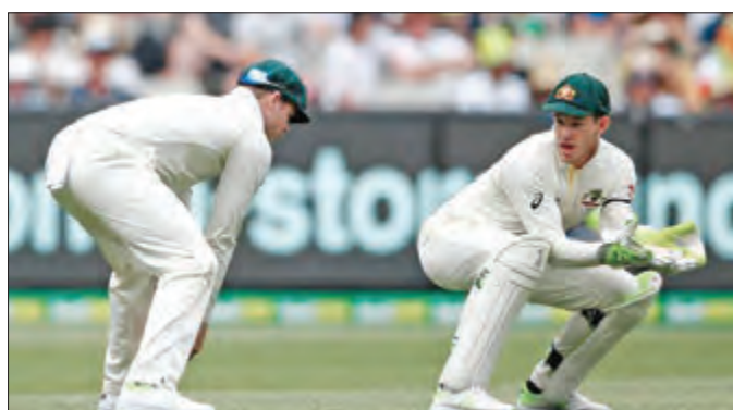
The Australians, minus those at the Indian Premier League, are now in 14 days' isolation at a hotel adjoining the Adelaide Oval after five weeks in a bio-secure environment in England.

Some, like coach Justin Langer, face a further fortnight in quarantine when they cross state borders and return to their home bases, with more of the same awaiting players throughout the Australian cricketing summer.