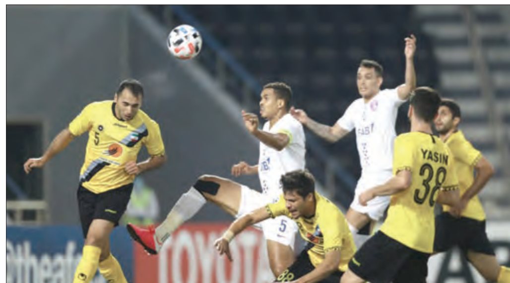
Sepahan FC joined Al Ain FC in elimination from Group D after their goalless draw in the 2020 AFC Champions League match at the Jassim Bin Hamad Stadium on Monday.